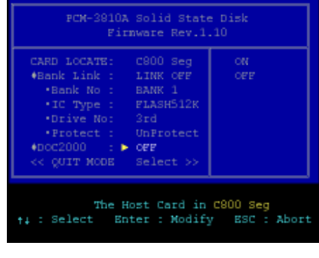
The "DOC® 2000" option

This function allows you to install a DOC 2000 chip on the 3rd socket of bank 2 to emulate one HDD.