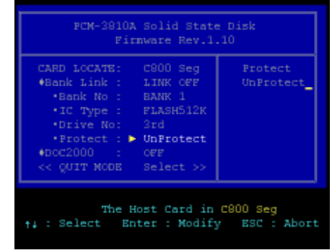
The "Protect" option

When you use the bank you are modifying to emulate a FDD, you can set the bank to "write enable" or "read only".