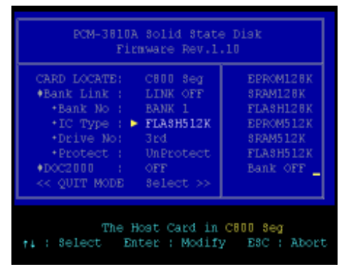
The "IC Type" option

The "IC Type" option allows you to set the type of ICs which you are going to install or have installed on the bank you are modifying. If you want to install a DOC 2000 on the PCM-3810A, refer to the "DOC 2000" option.