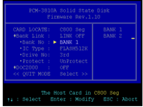
The "Bank No." option

The "Bank No." option allows you to choose the bank which you are going to modify.