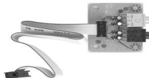
Figure 1-4 (Optional) 6 Channel Audio Adapter card