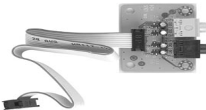
Figure 1-3 (Optional) 6 Channel Audio Adapter card